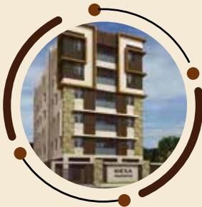
Hive Plot No: 3 - ABC, Jeshwanth Nagar 5th Mainroad A.N.A.Annamalai Ave, Ch - 37. Flats starting from 1700-1920 sq.ft