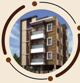
Sunshine Plot No.31, 2nd street, Cauvery Nagar, Saidapet, Ch - 15. Flats starting from 865 - 950 sq.ft